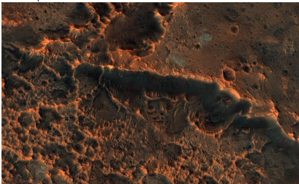
Write some sentences to describe it.