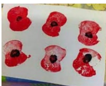
Apple printing poppies