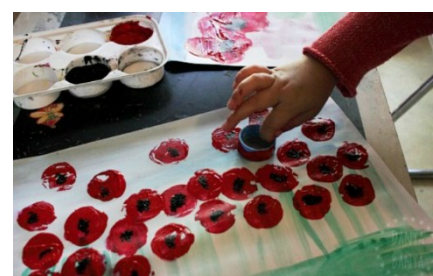
Bottle top printing poppies