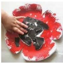
Paper plate poppies