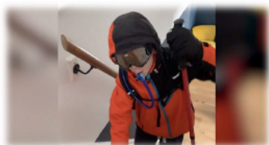
A member of the Cub group climbs their stairs as part of the tiring attempt

Yesterday, a group of Cubs completed a challenge to climb Mount Everest by climbing their stairs as part of a 'stay at home' challenge.