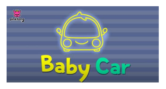
https://www.youtube.com/watch?v=KyBYuEgvFlO Can you find things that have an ar sound in them?