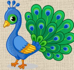
Paolo the Proud Peacock