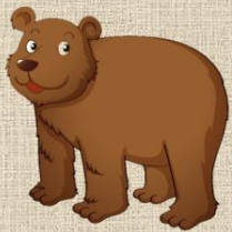
Bertie the Brave Bear

I check my progress and see how well I am doing.