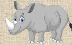
Rosie the Reflecting Rhino

I check my progress and see how well I am doing.