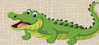
Annie the Analysing Alligator

I am beginning to correct my mistakes by myself.