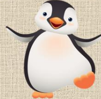
Percy the Persevering Penguin