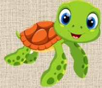
Tallulah the Turn-Taking Turtle