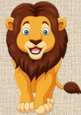
Leroy the Linking Lion