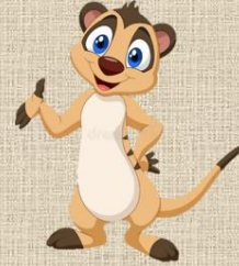
Molly the 'Myself' Meerkat