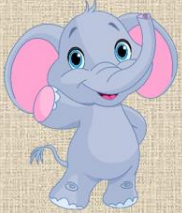
Eddie the Exploring Elephant