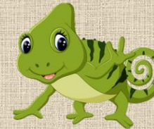
Connie the Creative Chameleon