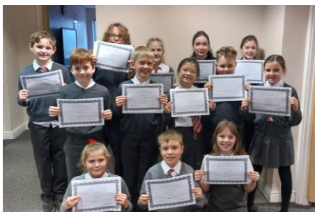
Great teamwork all of you!