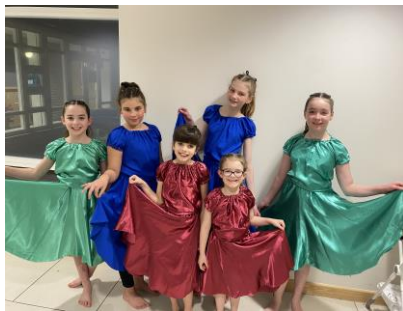
choreographed the dance and taught the children the dances.